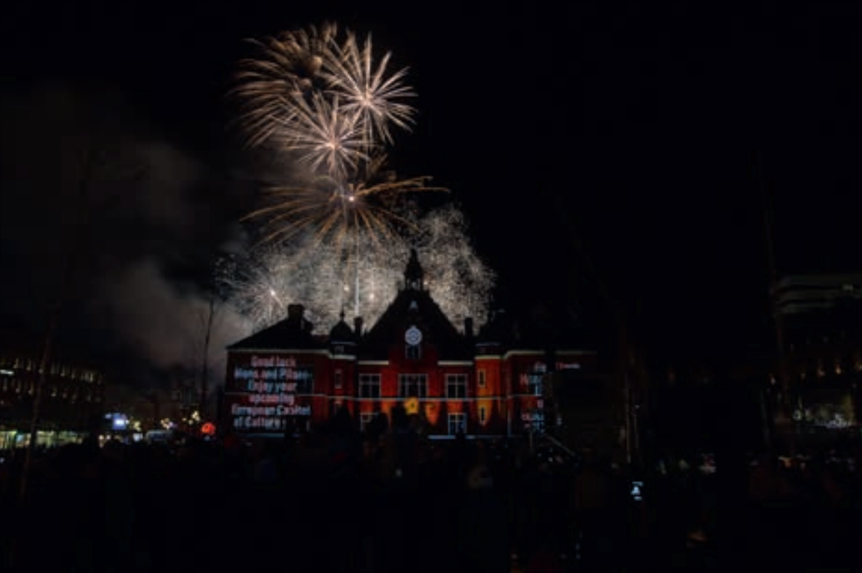
Umeå 2014 — Closing ceremony, Northern light