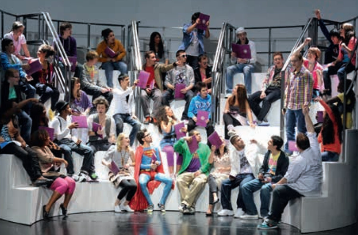
Essen for the Ruhr 2010 — TWINS project, Next Generation